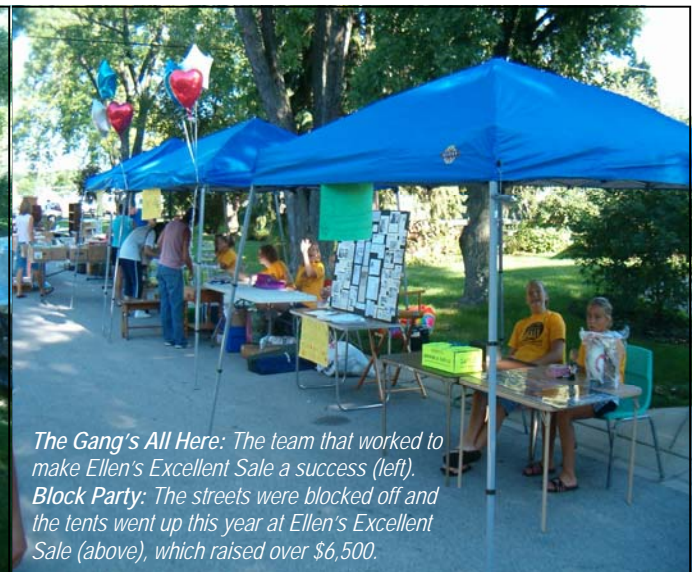
The Gang's All Here: The team that worked to make Ellen's Excellent Sale a success (left). Block Party: The streets were blocked off and the tents went up this year at Ellen's Excellent Sale (above), which raised over $6,500.